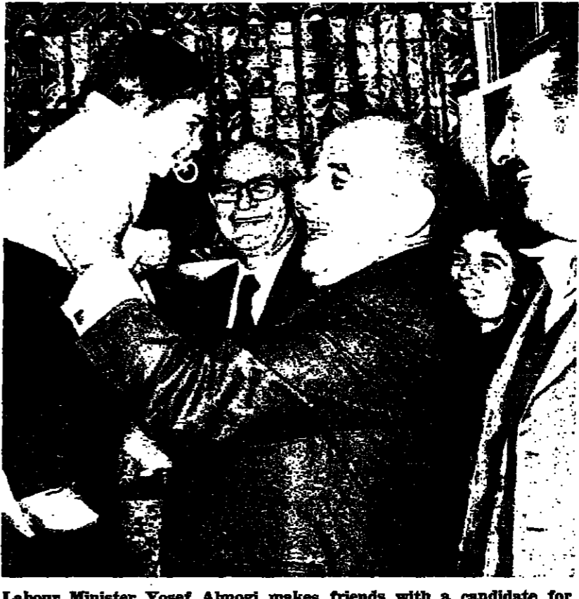
Labour Minister Yosef Almog makes friends with a candidate for the country's first industrial day creche in Kiryat Gat yesterday. Behind the Minister is Yisrael Pollak, president of Polgat; at right is Arye Meir, chairman of Kiryat Gat Local Council.

By YAACOV FRIEDLER Jerusalem Post Reporter HAIFA. - Efficient insulation and thicker window panes could make heating cheaper, and even do away with the need for it in some parts of Israel...'